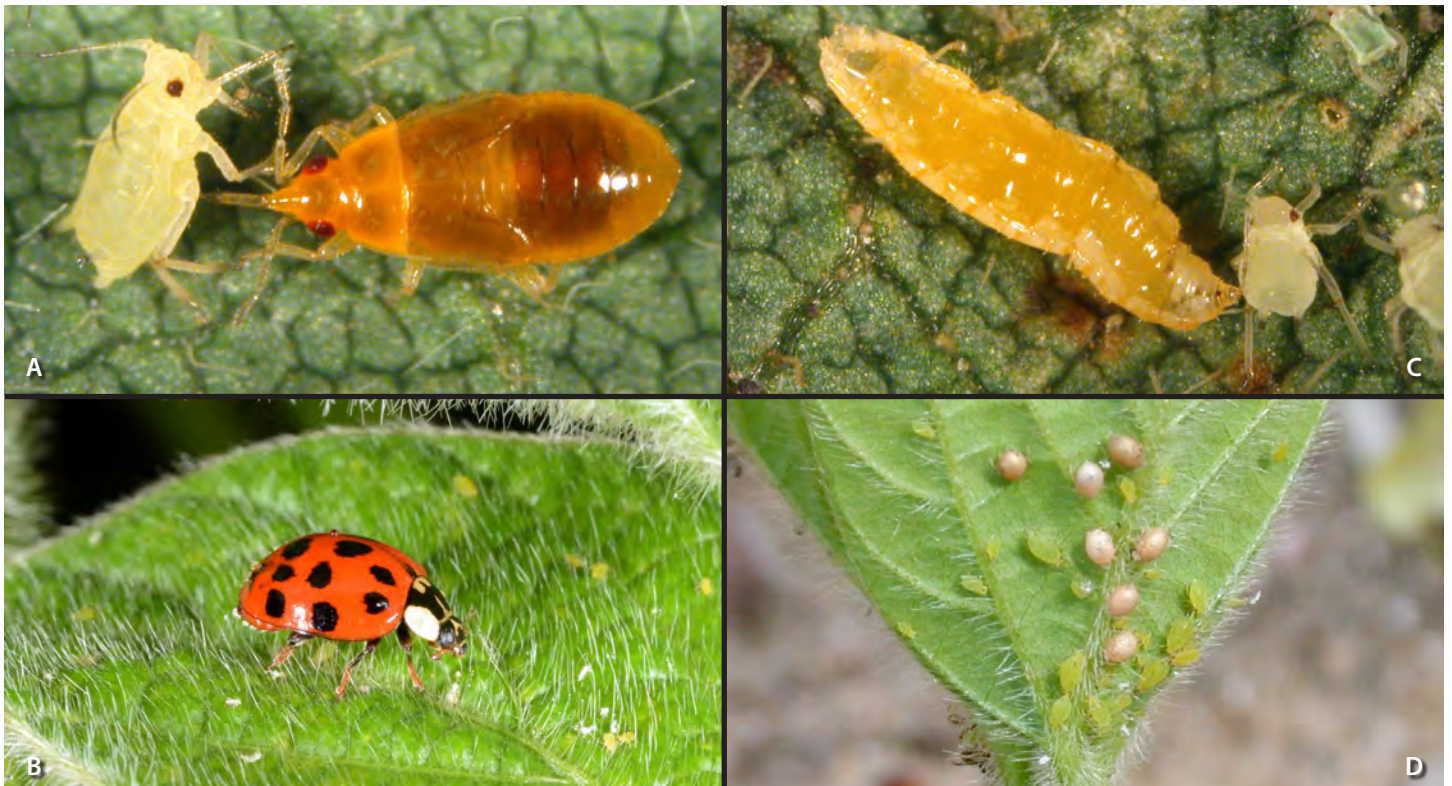
Figure 5. Predators, such as (A) an Orius nymph, (B) Asian lady beetle, (C) aphid midge larva, and (D) parasitic wasps typically suppress early-season infestations of soybean aphid.