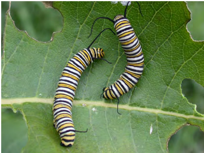
Figure 7. Non-target plants (such as milkweed) can absorb neonicotinoid residues and affect non-target insects (such as monarch butterfly caterpillars).

The same study demonstrated that in slug-infested fields, soybean grown without neonicotinoid seed treatments produced higher plant populations and yields than their treated counterparts. This study has important management implications, since slugs are emerging as a key pest in no-till cropping systems in many parts of the northern soybean production region.