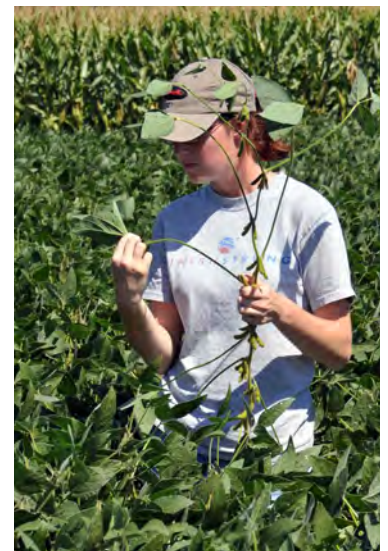
Figure 9. Scouting for insect pests is the tried and true approach.

Growers frequently face limited choices regarding seed treatments. Popular soybean varieties are often offered only with a pre-applied package of seed treatments. Growers who desire untreated soybean seed, or seed treated only with fungicides, should let their seed dealers know as early as possible when ordering seed for the next growing season.