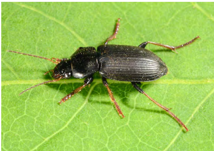
Figure 8. Ground beetles typically control slug populations. But slugs that feed on plants grown from neonicotinoid-treated seeds can pass the insecticide to the beetles.