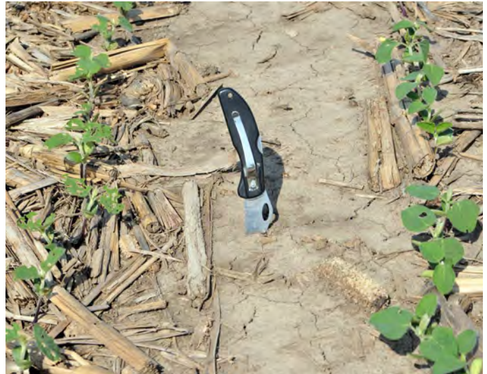
Figure 3. Early-season bean leaf beetle feeding on untreated soybean seedlings (left) and on neonicotinoid seed-treated seedlings (right). This minor feeding does not reduce yield.

The U.S. EPA extensively reviewed published and unpublished data regarding the yield benefits and concluded that “neonicotinoid seed treatments likely provide $0 in benefits to growers” (USEPA 2014).