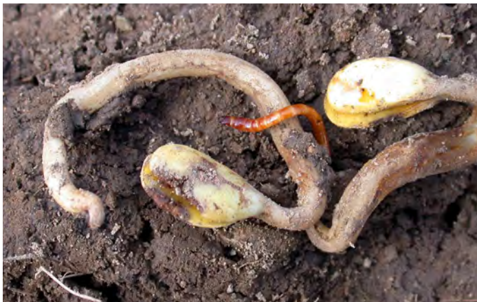
Figure 2. Wireworm feeding seldom reaches economically damaging levels.

These high-risk scenarios are uncommon in northern states. Seed and seedling pests such as wireworms, white grubs, and seedcorn maggots rarely reach economically damaging levels in the vast majority of soybean fields (Figure 2). Adult bean leaf beetles are