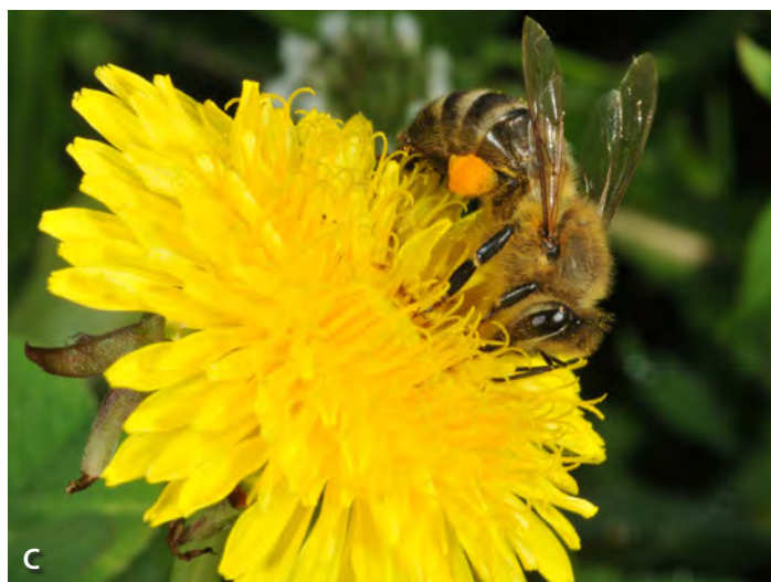
Figure 6. (A) Planter dust generated when planting treated seed contains a very high concentration of neonicotinoids that (B) can move off-target, and (C) potentially harm beneficial organisms.